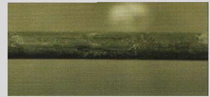
The rust occurrence for 1mm Pinna cle Plus(P+) wire after 200 hours.