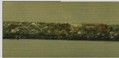
The rust occurrence for 1mm zinc galvanized wire after 200 hours.